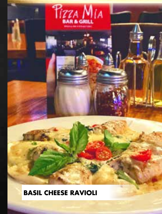
BASIL CHEESE RAVIOLI