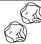
Tri Color Tortellini $11.99