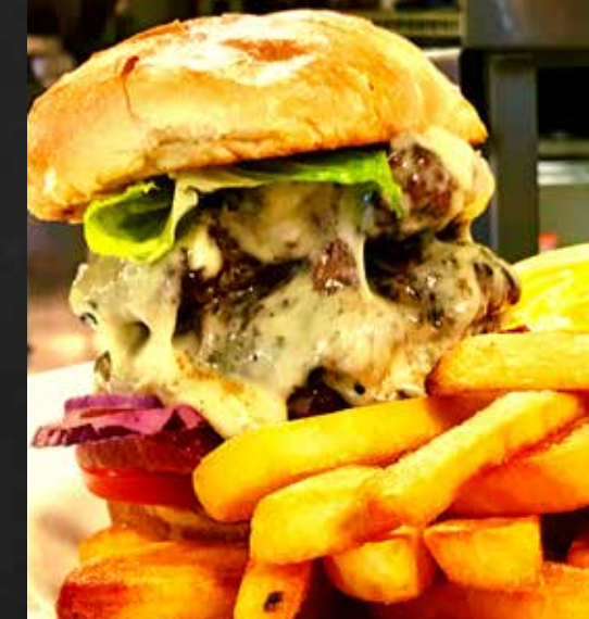
CREATE YOUR OWN BURGER